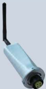
Data Logging Stick Wi-Fi