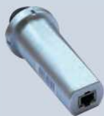
Data Logging Stick LAN