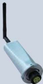
Data Logging Stick GPRS