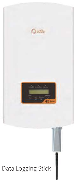
Data Logging Stick